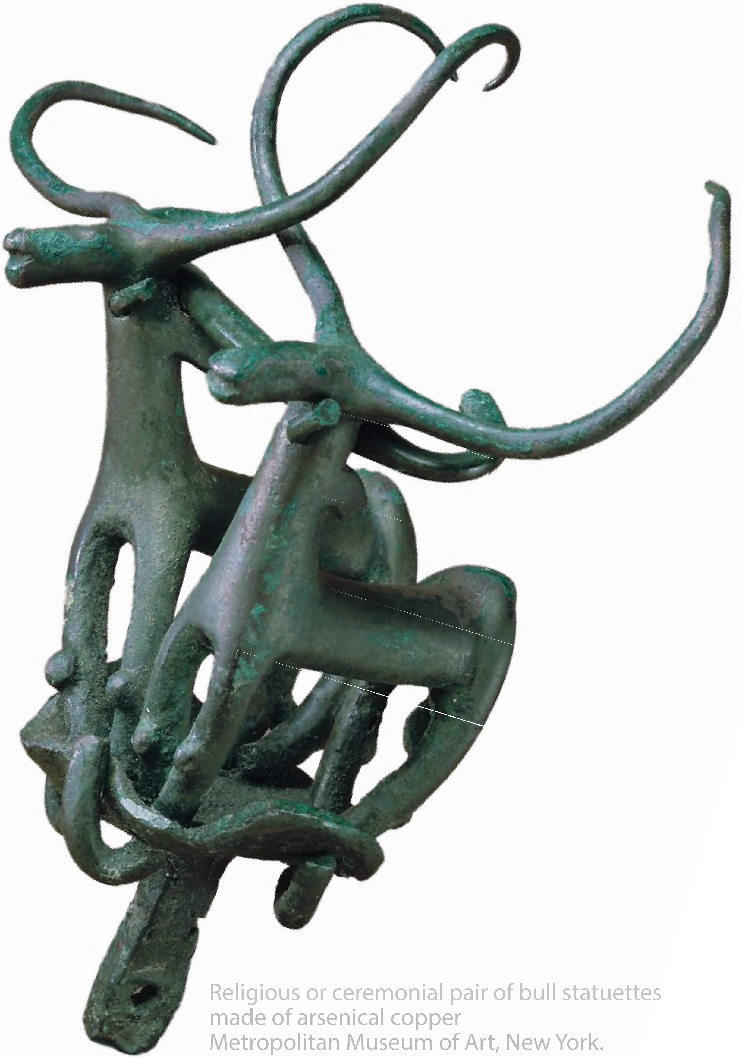
Religious or ceremonial pair of bull statuettes made of arsenical copper Metropolitan Museum of Art, New York.

The Legacy of Cuneiform Documents "FOOD CULTURE IN HITTITES"